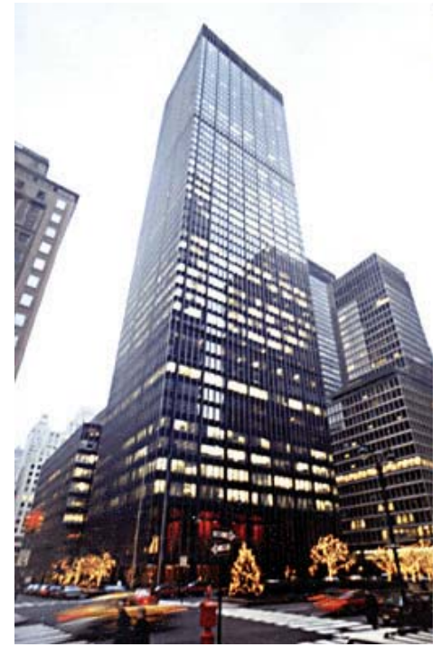
Ronsco recently completed work at the 1.1 million sq. ft. JP Morgan/Chase Building at 270 Park Avenue.

WC&C congratulates Ronsco, Inc., winner of the AWCi 2006 Safety in Construction Award. •